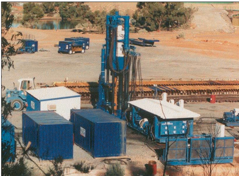
ARD's largest raise drill - the 121R, on site.

Work safety is also a priority and ARD is proud of it's excellent safety record. In all, the ARD/CRE group offers a professional and pragmatic approach to all shaft projects.