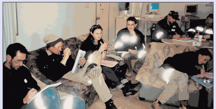
Shiftwork Training at Lawlers